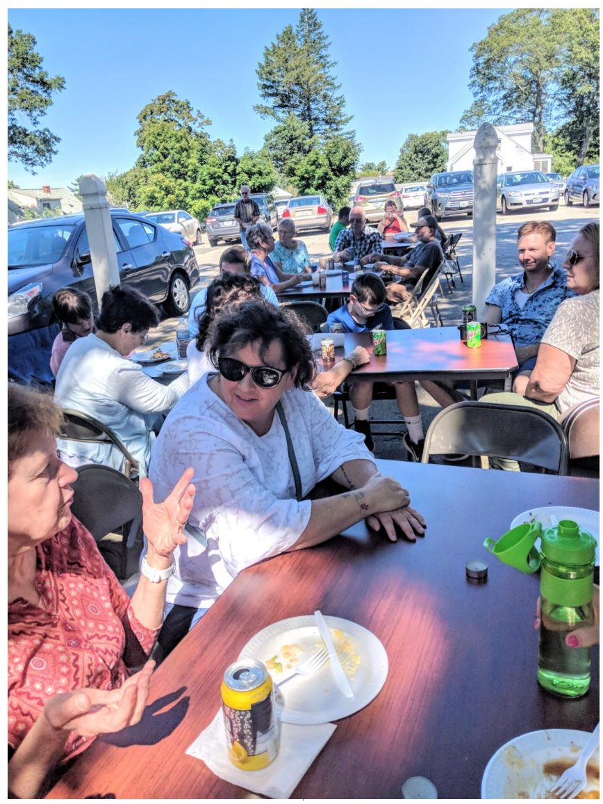
(Church picnic Emanuel courtyard 2016

Emanuel Church Picnic after worship at Emanuel food, fun, friends